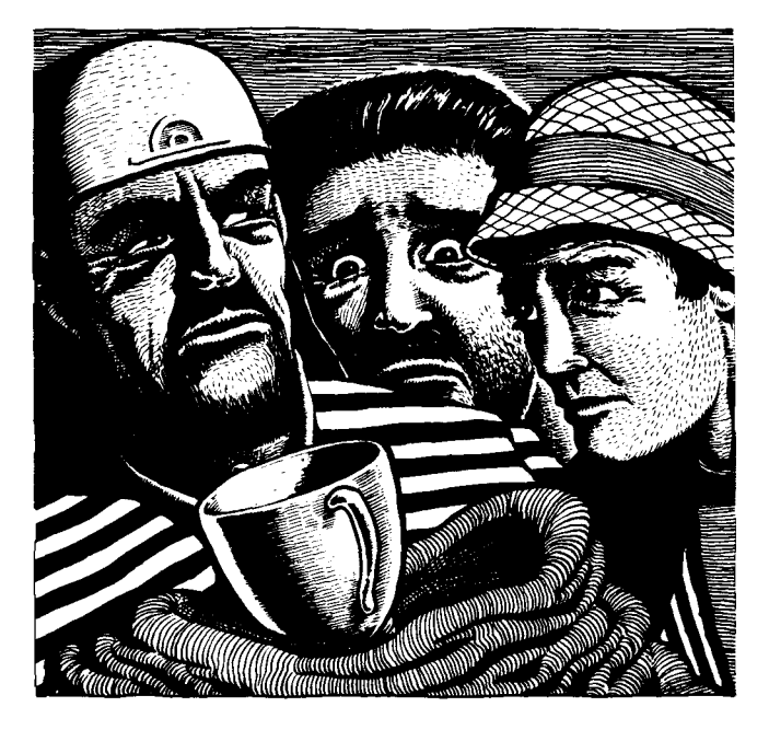
Joseph's servants looked into Benjamin's sack, and there was the missing silver cup.

The brothers had no choice but to return to the