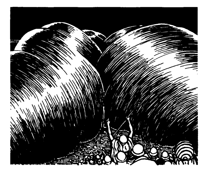
Roaring like a gigantic waterfall, the water began to roll back before Moses' outstretched arms!

The final plague was too much for Pharaoh. Complete the quote in Exodus 12:31: "And he called for Moses and Aaron by night, and said, and